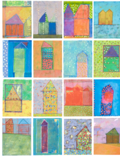
Joan Gold, Community , 2008 Acrylic and mixed media on paper 16 x (11 in. x 8.5 in.)

A unique aspect of Gold's overall process involves the use of the studio space itself where she covers the walls from floor to ceiling with her pieces. Gold explains this, saying, "The best moment is when there are a great many pieces pinned to the walls just before being dismantled and reborn into their final forms. My workspace becomes the world as I want it, a safe place full of color and light." The sanctuary of her studio allows Gold to manipulate and reorganize her work on the walls as she progresses, and this often informs new work. Surrounded by these modular, interchangeable pinnings , grouped into bodies she calls trios and quartets, she sometimes plays for years until she finds their appropriate arrangement. The next stage in the process is stacking these groupings on top of one another and affixing them to museum board or canvas, forming panels, which then blanket her studio walls.